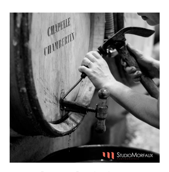
Domaine Drouhin-Laroze www.drouhin-laroze.com

The 2022 Bonnes-Mares Grand Cru, blended with 25% whole bunches, has quite a perfumed and aromatic bouquet: white flowers and potpourri infusing the black cherry and red plummy fruit. The palate is medium-bodied with fine tannins. It offers much more composure than the Latricières, with a poised, persistent finish. Excellent.